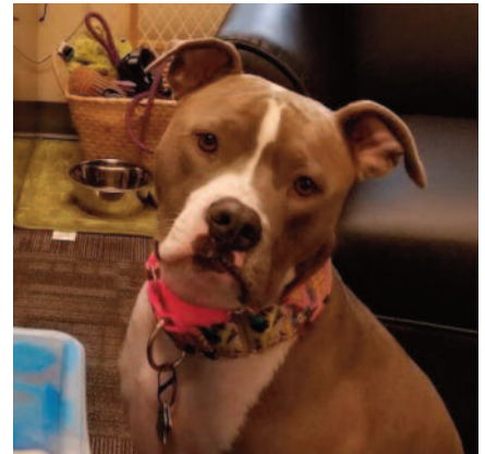
Luka, Family Services resident pet therapist