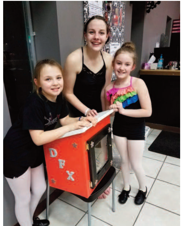
Students from Dance FX studio who constructed and decorated a kit to be placed in the community. They also held a book drive from which we received dozens of children’s books.