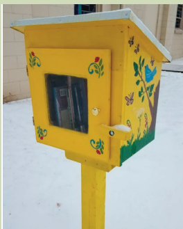
Merrill & 3rd Street